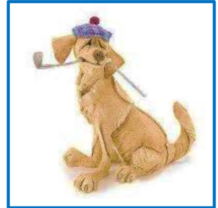
Fall River Valley Golf & Country Club

Mark your calendars... 11 th Annual SNIPPP Golf Day June 9, 2018